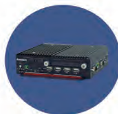
PC Module (PM)