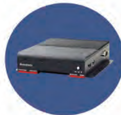
Video Module (VM)